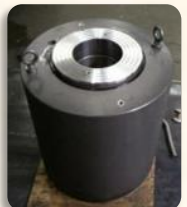
CUSTOM 420 TON JACK