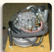
CUSTOM HYDRAULIC PUMP