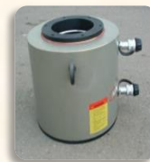
CUSTOM 150 TON CYLINDER