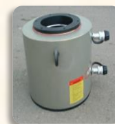
CUSTOM 150 TON CYLINDER